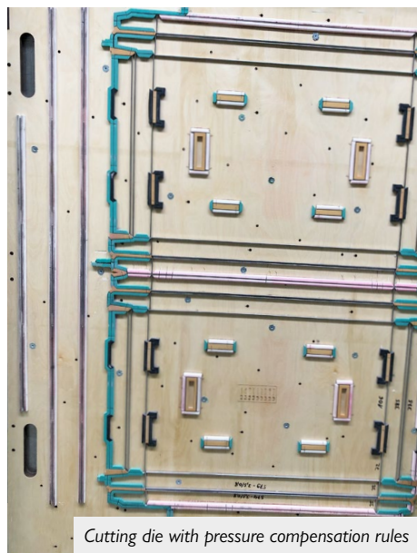
Cutting die with pressure compensation rules